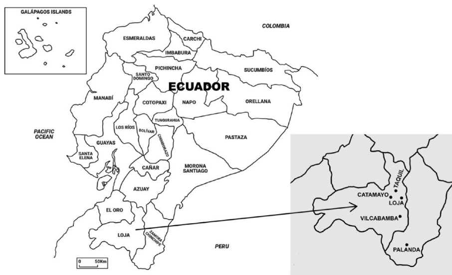
Fig. 1. Location of the samples zones.

bedrock undergoes weathering processes, such as chemical dissolution and physical breakdown, the equilibrium can be disturbed. Weathering can lead to the redistribution of elements and the formation of secondary minerals with different solubilities and precipitation rates. This can result in the preferential retention or release of certain radioactive nuclides, causing disequilibrium within the natural series.