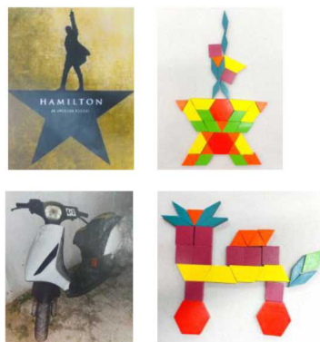
Fig. 2. Transformation of figurative images to geometric compositions with pattern blocks.

3. In recent years, D'Amore and Duval (2023) proposed three types of geometric and pictorial visualization: