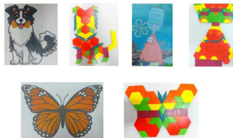
Fig. 4. Images with middle grade of iconicity reduced to a simple composition of geometric elements

4. Conclusions. The results shown positive student attitude toward interdisciplinary learning and an improvement in the understanding of geometric interpretation, highlighting the potential of using pattern blocks (Riera et al., 2015) as educational innovation resources in Secondary Education.