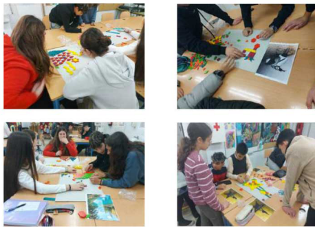
Fig. 1. Students transforming figurative images.

1. Visualization acts as a core methodological tool for enhancing motivation and active participation, transforming the art classroom into a space for mathematical learning and artistic creation.